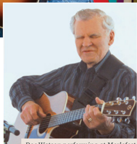
Doc Watson performing at Merlefest.

However, Doc's impact extended far beyond just guitar players and bluegrass music. He was a major force in preserving traditional folk music, championing songs that would have otherwise been lost to time, and introducing them to new generations of listeners. Doc's soulful voice combined with his ability to play guitar, banjo, harmonica and mandolin